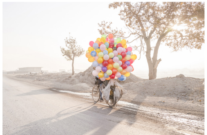
From the exhibition Inferno & Paradiso © Véronique De Viguerie