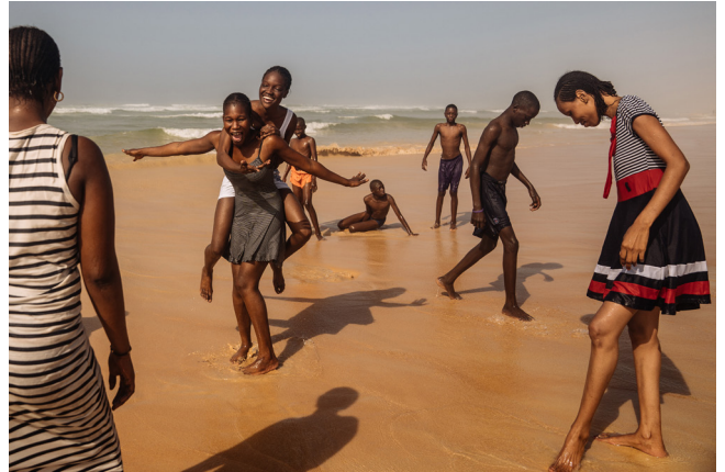
From the exhibition Inferno & Paradiso