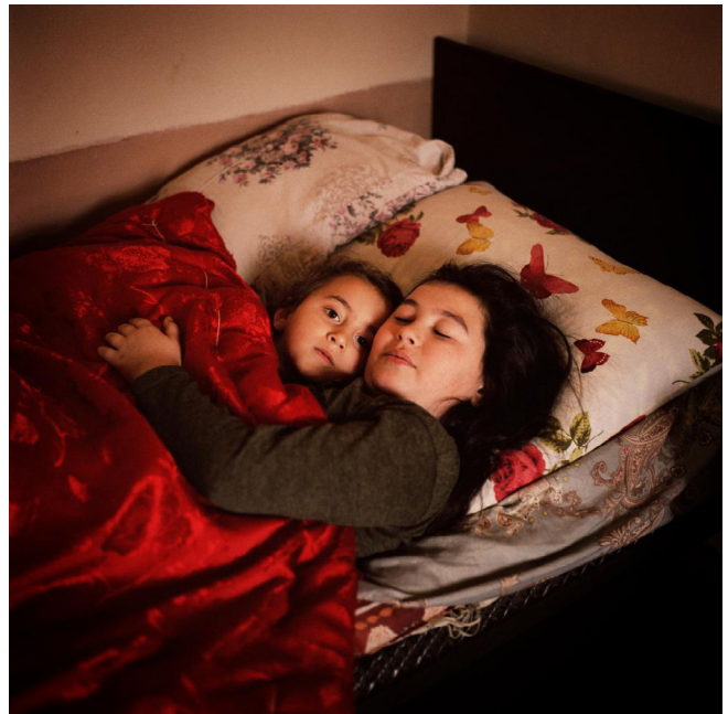
From the exhibition Inferno & Paradiso © Anastasia Taylor-Lind