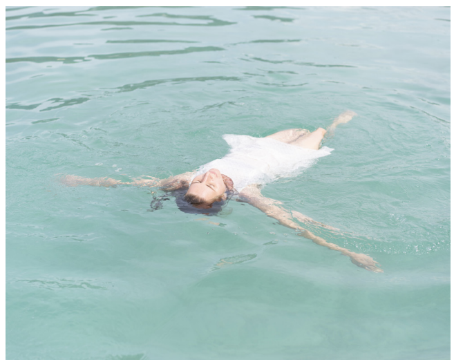
From the exhibition Inferno & Paradiso