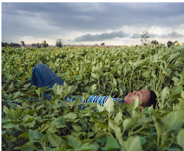
From the exhibition Inferno & Paradiso