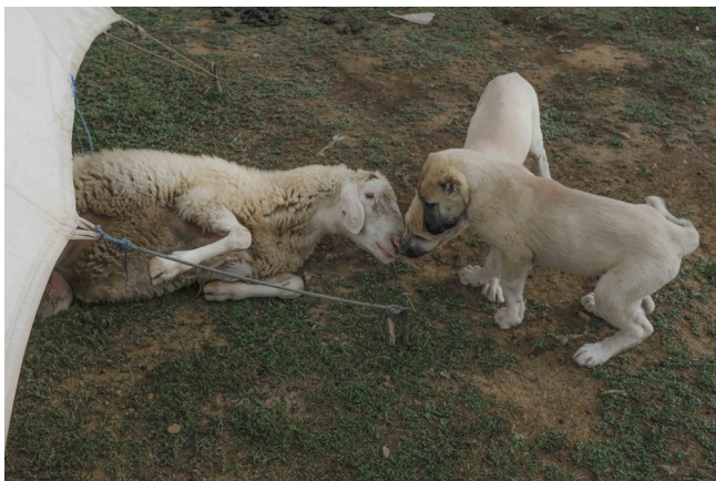
From the exhibition Inferno & Paradiso