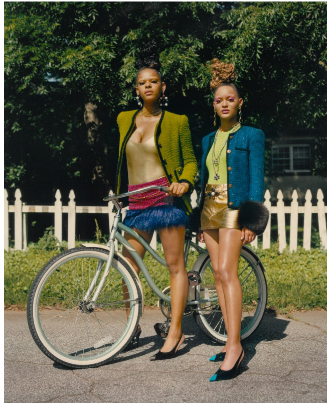
Tyler Mitchell, Untitled (Sisters on the Block), 2021