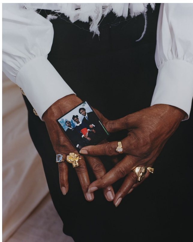
Tyler Mitchell, The root of all that lives , 2020, Courtesy of the artist and Gagosian Gallery © Tyler Mitchell