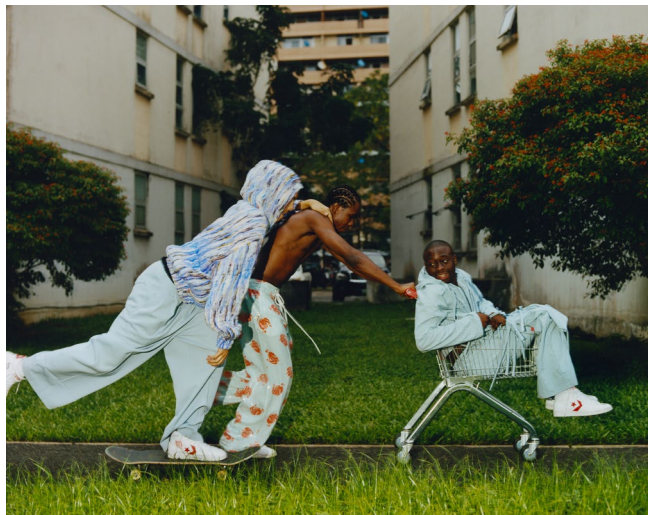
Tyler Mitchell, Motherlan Skating , 2019, Courtesy of the artist and Gagosian Gallery © Tyler Mitchell

This reproduction authorization is granted subject to the following conditions: - Full and unaltered reproduction of the works - Mention of the name of the author, the title of the works and their date of creation as well as the following caption and copyright: Courtesy of the artist and Gagosian Gallery © Tyler Mitchell