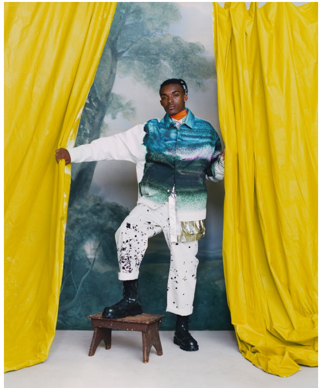
Tyler Mitchell, Curtain Call, 2018