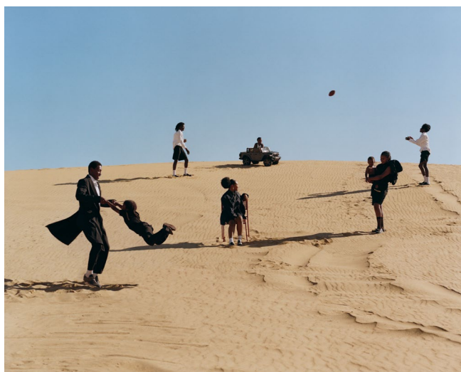
Tyler Mitchell, Albany, Georgia, 2021