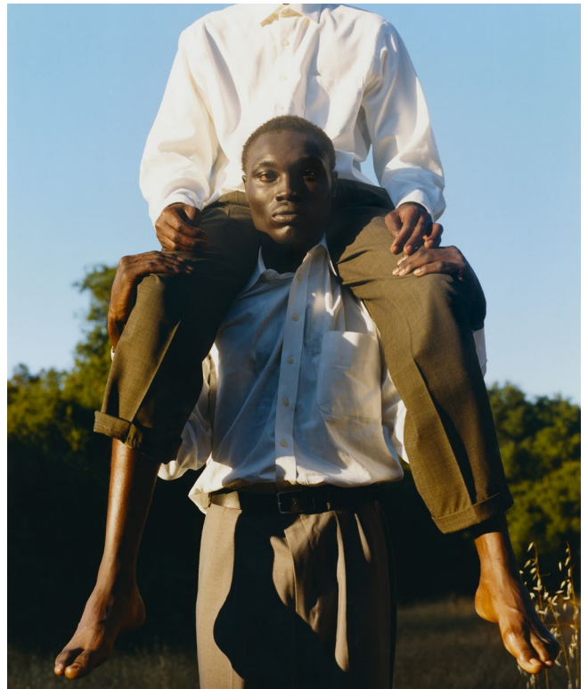
Tyler Mitchell, Untitled (Topanga II) , 2017