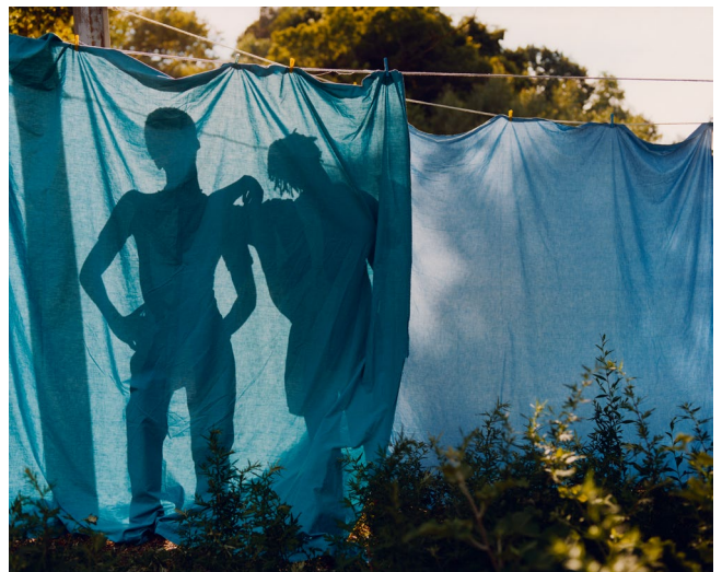
Tyler Mitchell, Untitled (Blue Laundry Line) , 2019, Courtesy of the artist and Gagosian Gallery © Tyler Mitchell