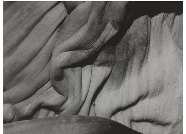
Henriette Grindat, Variation sur l'agave , 1967