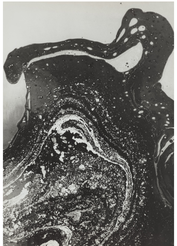
Henriette Grindat, Matière , 1962 © Henriette Grindat / Fotostiftung Schweiz.