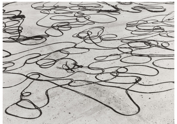
Henriette Grindat, Minorque , 1963