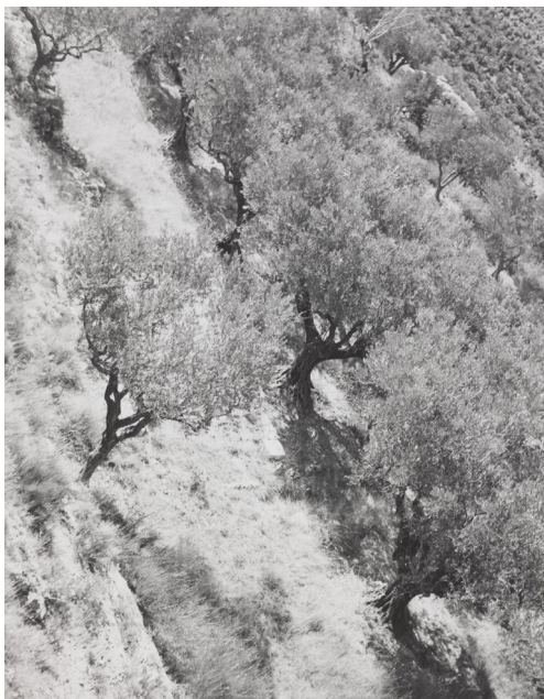
Henriette Grindat, Les oliviers du Rébanqué-Lagnes , 1951 © Henriette Grindat / Fotostiftung Schweiz.